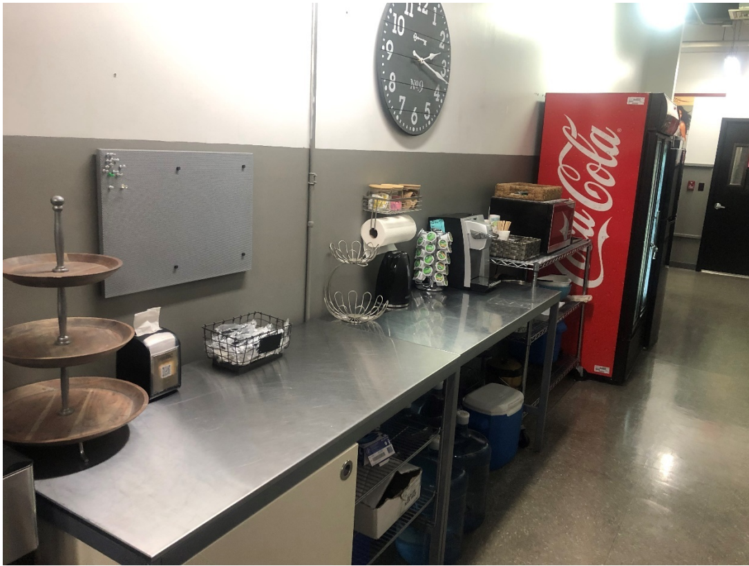
3 rd Floor Catering Area – Single restrooms located on this level as well