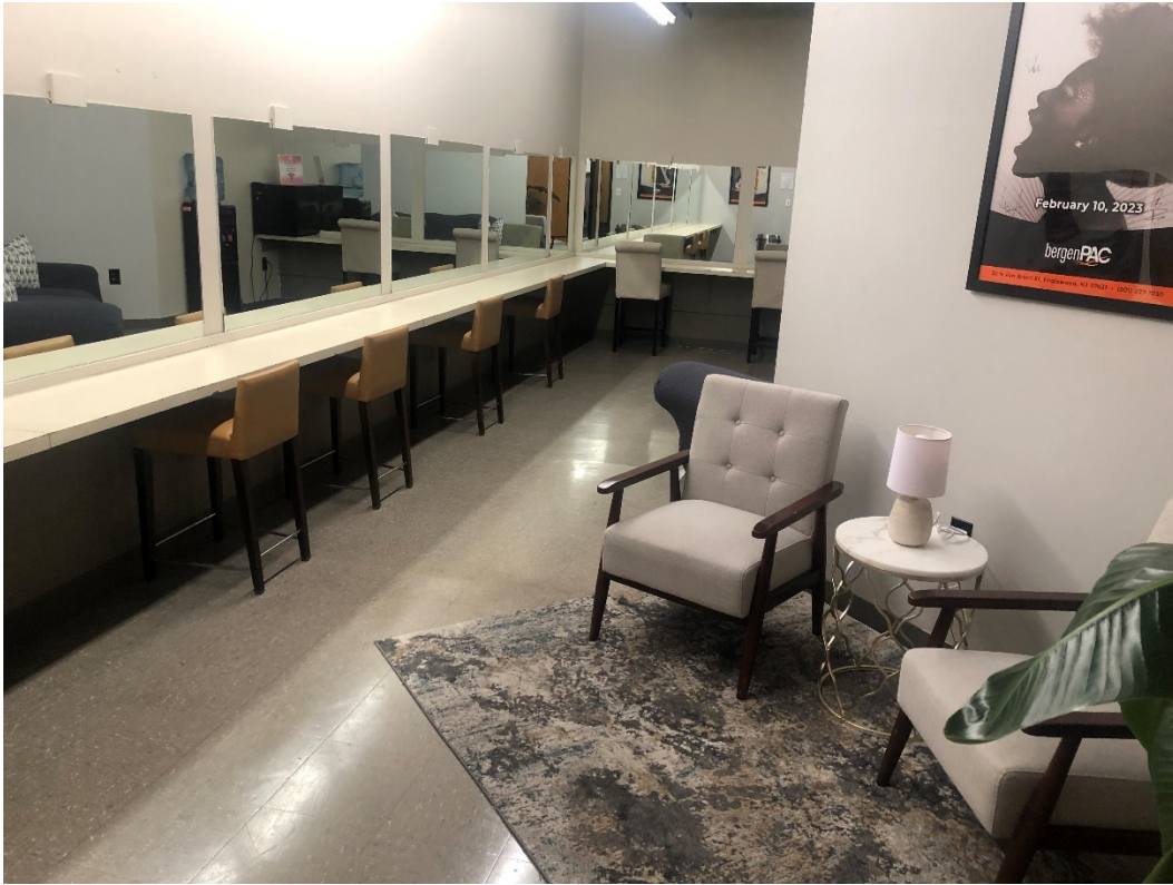
Chorus 4 – Restrooms including shower, washer, & dryer located directly across