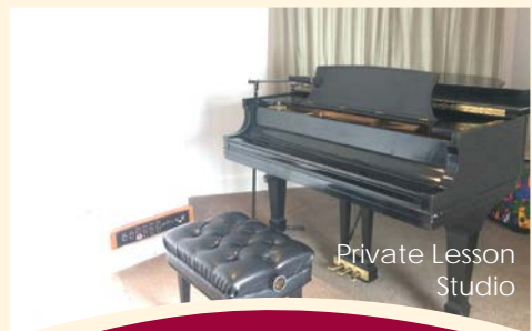
Private Lesson Studio