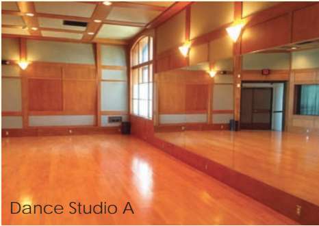
Dance Studio A

The Performing Arts School has six studio spaces for classes in dance, theater, and music– including a recording studio and space for private lessons. These spaces are also available for private events– for more information, see page 15 .