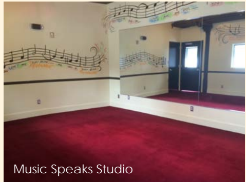
Music Speaks Studio