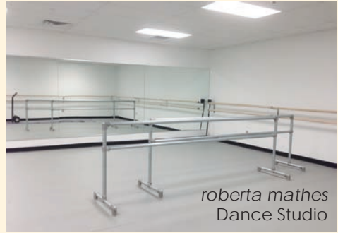
roberta mathes Dance Studio